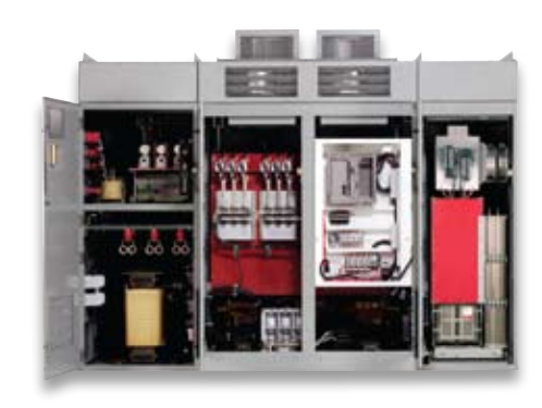
AMPGARD SC 9000 Medium Voltage Adjustable Frequency Drive