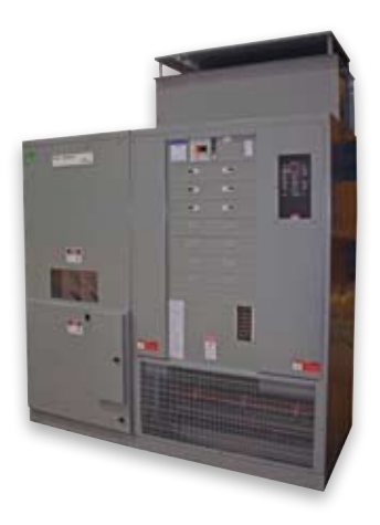
Unitized Power Center