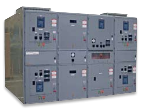
5/15 kV Type VacClad-W Arc-Resistant Switchgear