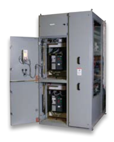
Front Accessible MV Switchgear