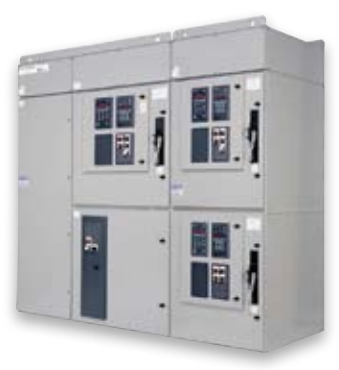
AMPGARD® 7.2 kV Lineup