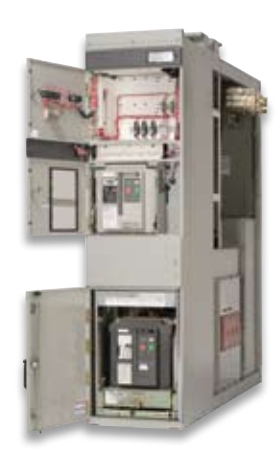
Integrated Unit Substation