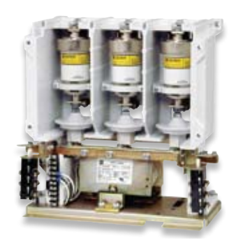
SL Medium Voltage Vacuum Contactor