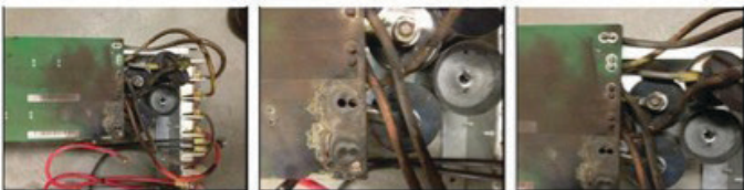
Figure 1. Capacitors with clear visual evidence of failure. Note, capacitors may fail with no obvious signs.

Adverse operating conditions such as excessive current and heat can hasten the demise of capacitors.